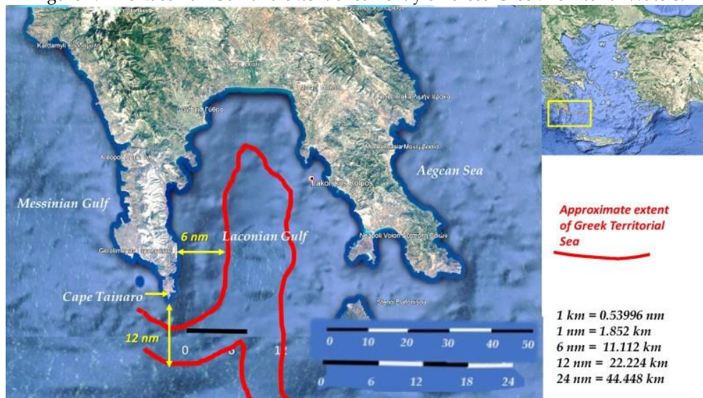
Figure 1. The Laconian Gulf and extent of currently enforced Greek Territorial Waters.