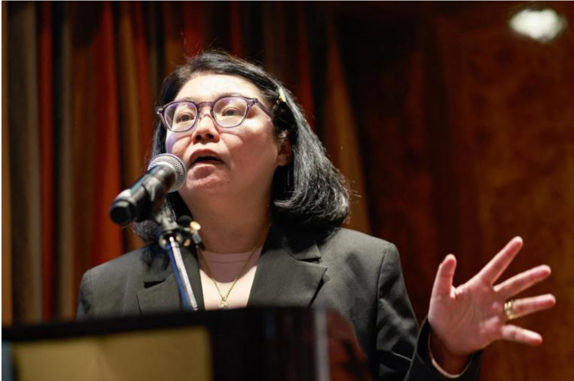
Figure 3. Rena Lee, UN ambassador for oceans and law of the sea announcing the BBNJ agreement to protect the oceans 4 March 2023

However, the ship may be within sight of the shore but is probably a long way from it.