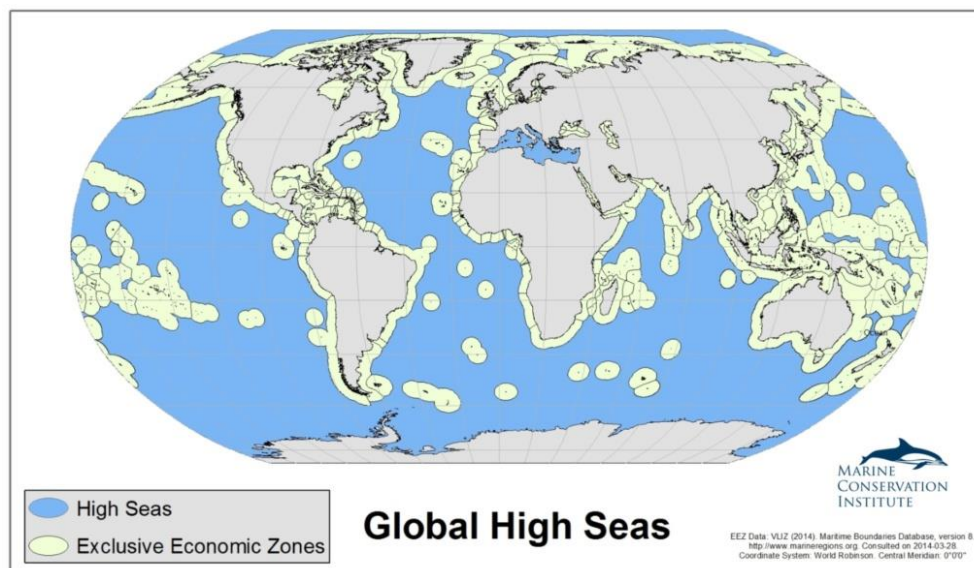
Figure 5, High Seas outside EEZs. The author disagrees with this definition of 'High Seas', which technically begin outside Territorial Seas, but it is a practical working one and perhaps should be adopted in a revised UNCLOS.

However, although the Treaty focusses, as its name implies, on biodiversity, a key issue is that still divides developed and developing nations was how to share marine genetic resources (MGR) and the eventual profits fairly. MGR, which consist of the genetic material of deep-sea marine sponges, krill, corals, seaweeds and bacteria, are attracting increasing scientific and commercial attention due to their potential use in medicines and cosmetics.